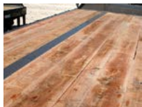
ROUGH OAK FLOOR