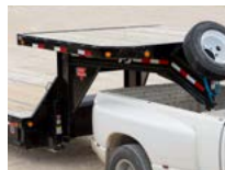
REMOVABLE DECK ON THE NECK