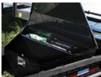
FULL SIZE DIVIDED TOOLBOX UPGRADE (T8 & T9)