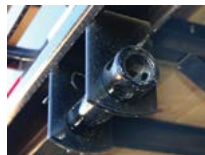
SLIDING STRAP RATCHETS