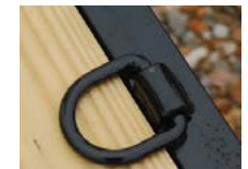
1 PAIR D-RINGS