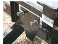
SPARE TIRE MOUNT