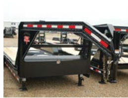
8" I-BEAM GOOSENECK