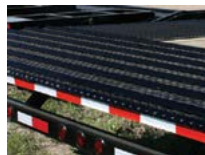
1X1 ANGLE TRACTION BARS ON REAR OF DECK (T8, T9 & TD)