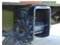
WELD ON STRAP RATCHETS