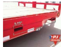
PALLET FORK HOLDERS (T6 & TF)

SOME OPTIONS NOT SHOWN, PLEASE VIEW PRODUCT PAGE FOR A LIST OF ALL OPTIONS