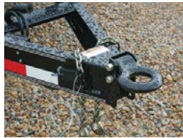
3" PINTLE EYE