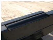
WINCH CABLE ROLLER