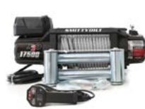
TRAILER WINCH (9.5K - 17.5K)