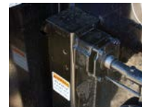
2 SPEED JACKS