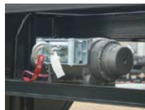
WINCH 12VDC (12,000 LB)