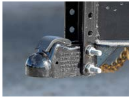
BP 2 5/16" ADJ. CPLR W/HD 6 HOLE CHN BRKT (20K)